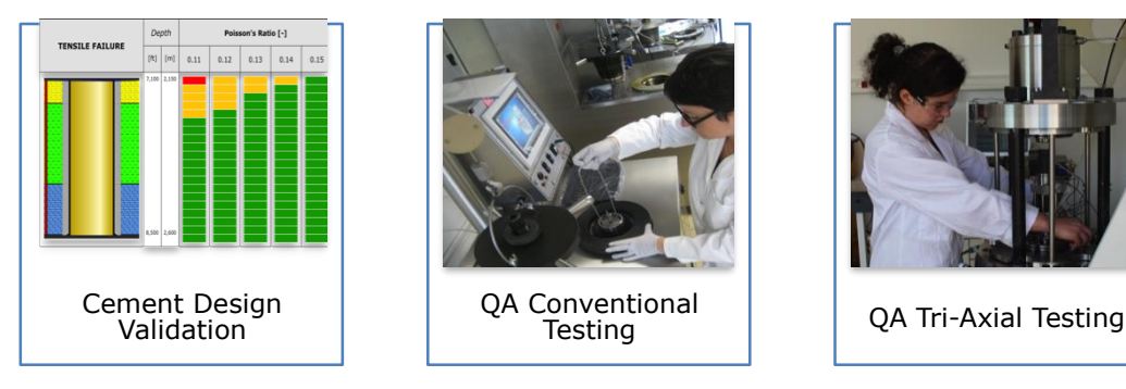
Figure 3. QA/QC steps

Step four: Quality assurance / Quality control (Figure 3) Cement sheath design validation and quality assurance laboratory testing is typically performed once the cement design has been blended and prior to being delivered to the well site. Typically quality assurance testing includes both conventional and triaxial load cell cement testing, and helps ensure that job problems do not occur and that the blended cement meets the mechanical performance requirements.